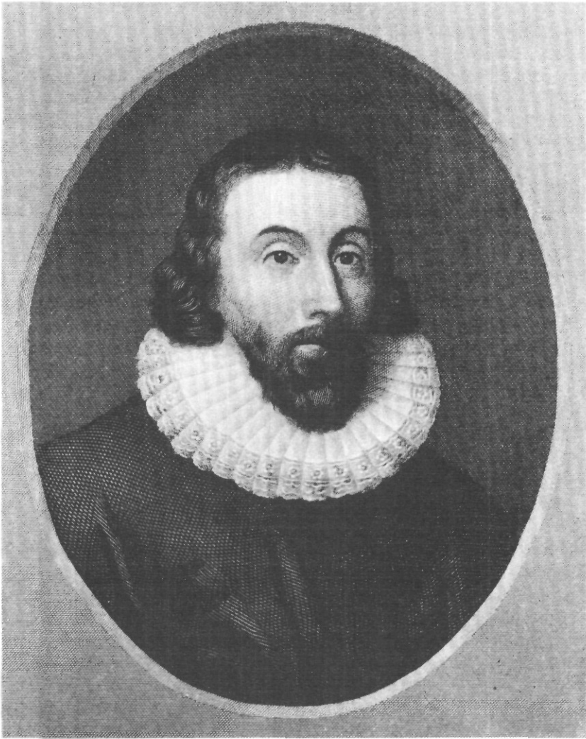
John Winthrop