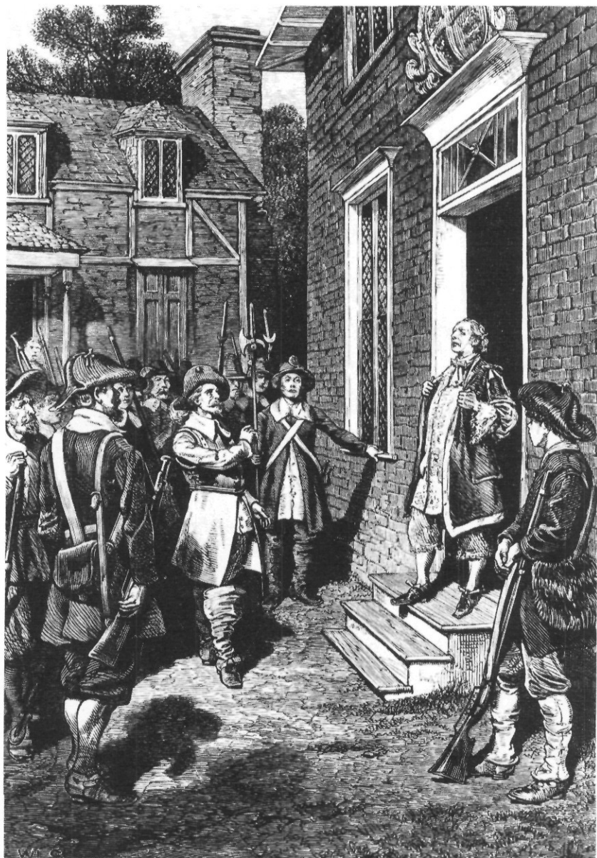
Governor Berkeley and the Insurgents (Bacon's Rebellion, 1676)