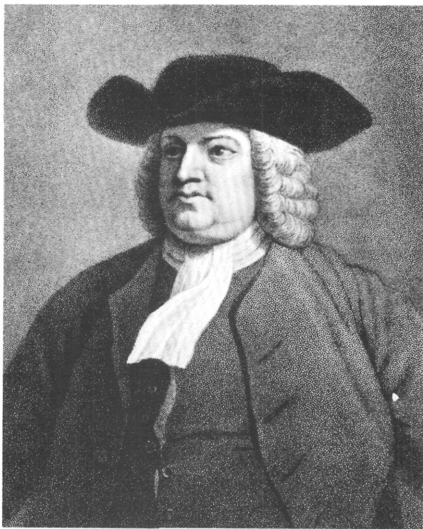
William Penn