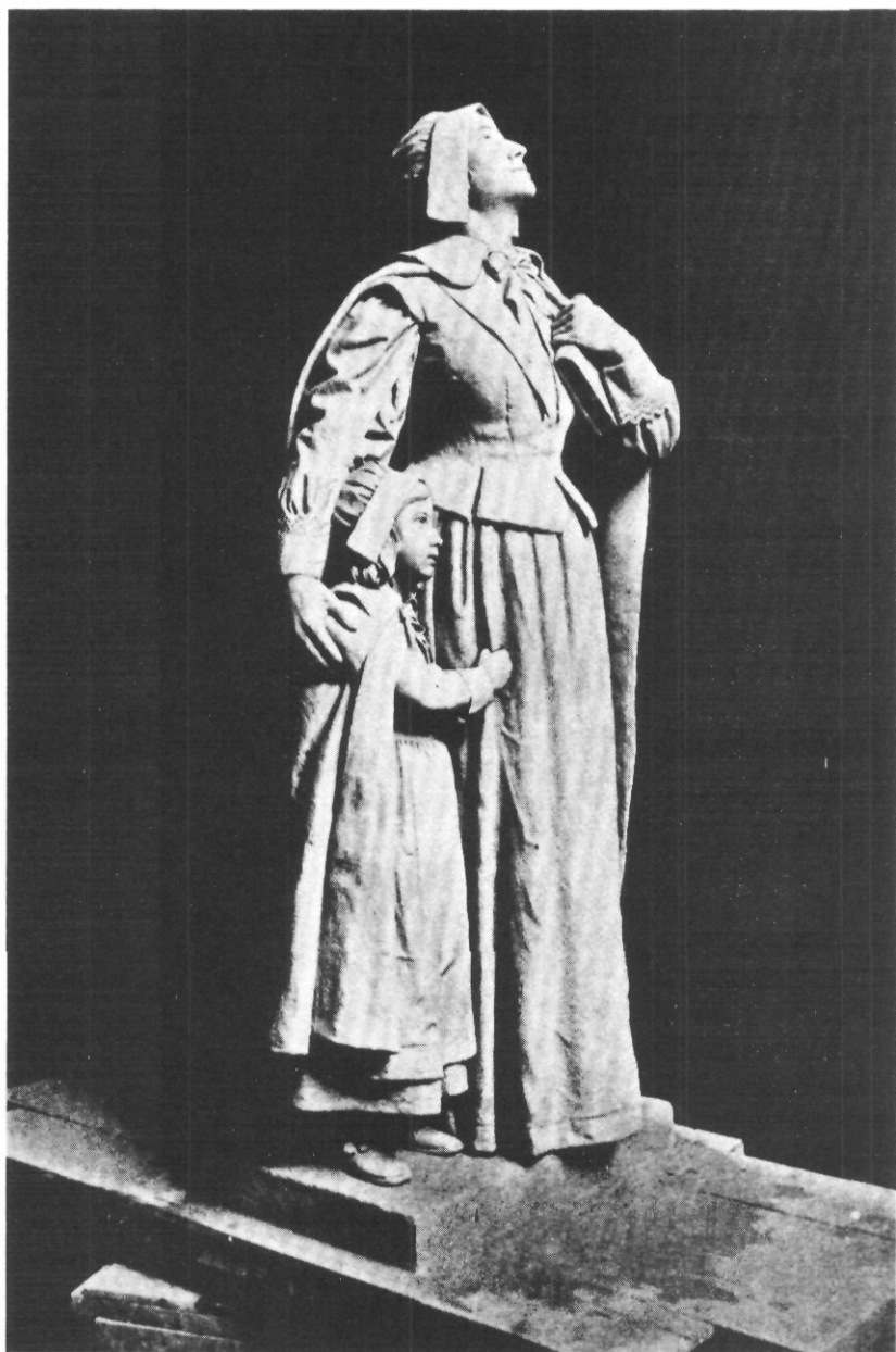
Statue of Anne Hutchinson