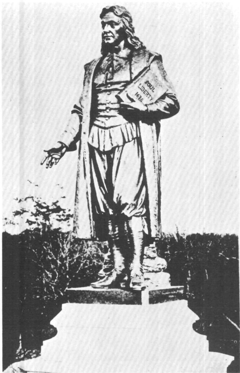
Statue of Roger Williams in Providence, Rhode Island